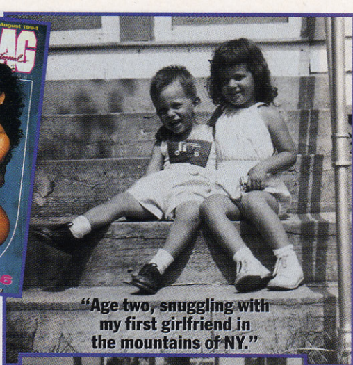
"Age two, snuggling with my first girlfriend in the mountains of NY."