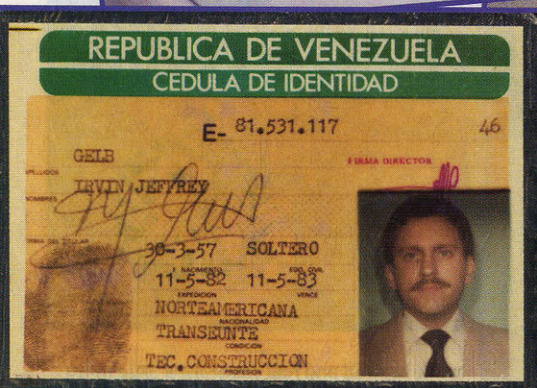
Venezuelan ID card – "Do I look like a local?"