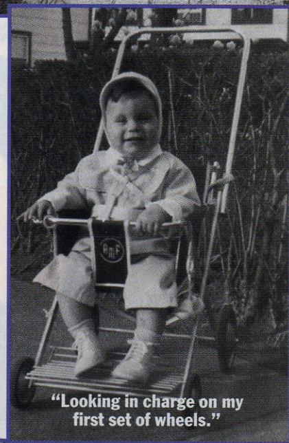
"Looking in charge on my first set of wheels."