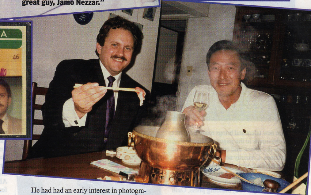
"Enjoying sukiyaki in Japan after closing my first entertainment deal – The Simpsons sold to Japanese TV."